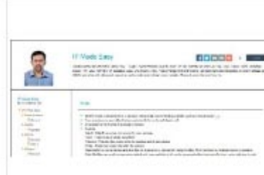
Tutorials Made To Share IT Knowledge