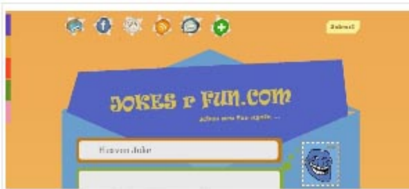
jokesfun.com - (Designing it was the biggest fun. PHP personal site)