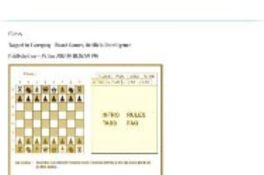
Javascript + PHP Chess (Artificial Intelligence)