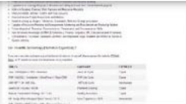
vinodsebatian.net - My Profile Website