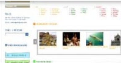
artlitgames.com (C# and ASP.NET personal website)