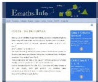
emaths.info (Maths personal website - C# and ASP.NET)